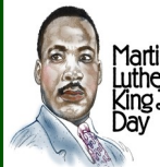
Martin Luther King Jr. Day

The 45th Annual MLK Holiday Grand Parade will start at 11:00 AM from EverBank Stadium Parking Lot to the Prime Osborn Convention Center on Jan 19, 2026. The MLK Day festivities continue at James Weldon Johnson Park.